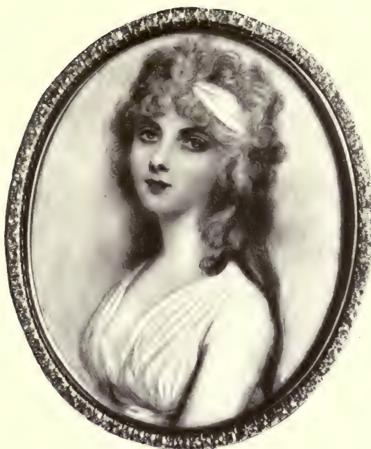
THE HON. HARRIET RUSHOUT (Ob. 1851) BY ANDREW PLIMER